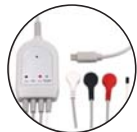
ECG & Temp Cable