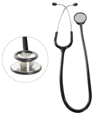
Small Diaphragm: 35mm