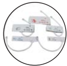
Disposable NIBP Cuff