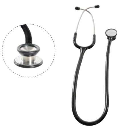
Small Diaphragm: 30mm