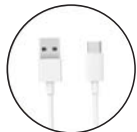
Type-C Charging Cable