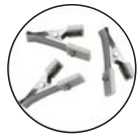
ECG Electrode Clip