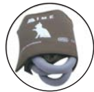
Reusable NIBP Cuff